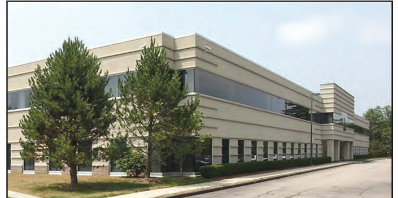
9 Industrial Road - Milford, MA

After a comprehensive search of the market it became apparent that despite a tremendous amount of office vacancy along Rte. 495, 9 Industrial Rd.