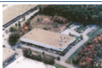
75 October Hill Road - Holliston, MA